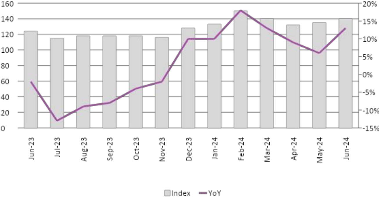
foundit Insights Tracker