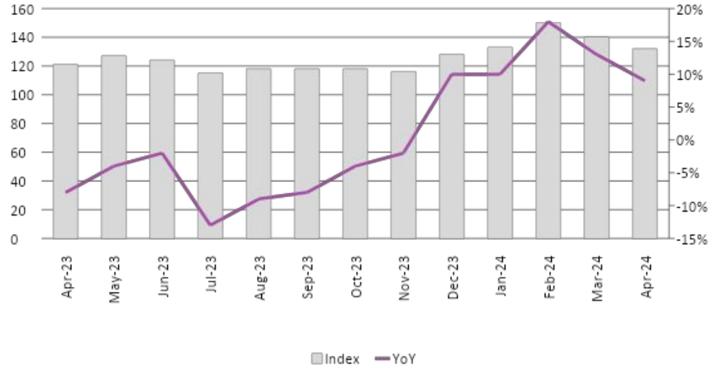
foundit Insights Tracker