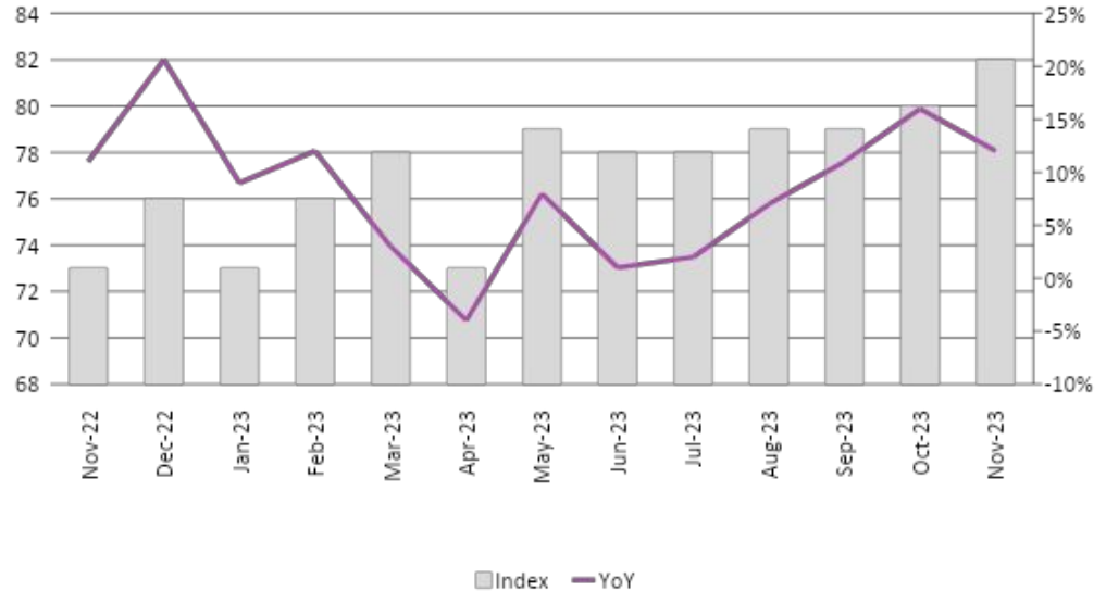
foundit Insights Tracker